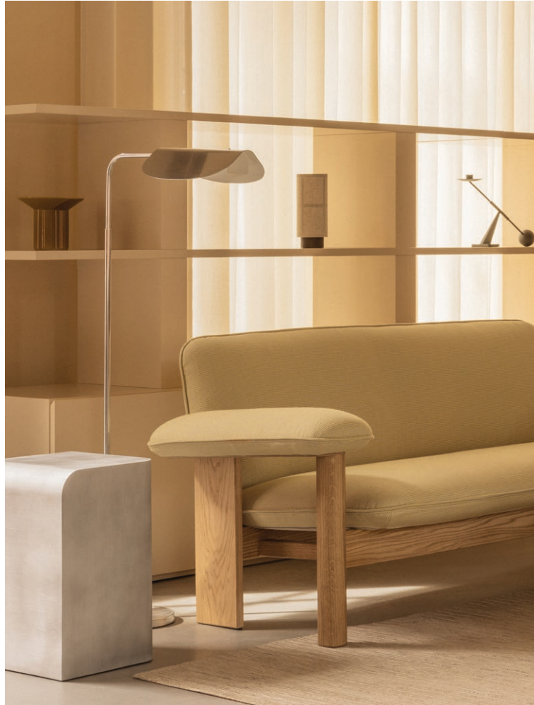
BRASILIA SOFA Designed by Anderssen & Voll